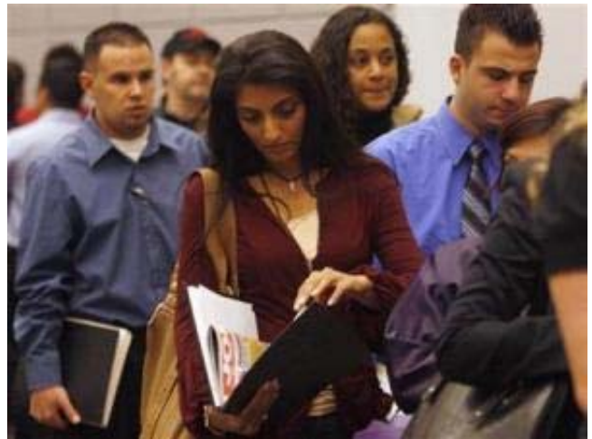
A study has found people with ethnic names find it tougher to get job interviews

"It certainly suggests Anglicising your name increases the chance of getting a job interview," Prof Leigh told reporters in Canberra.